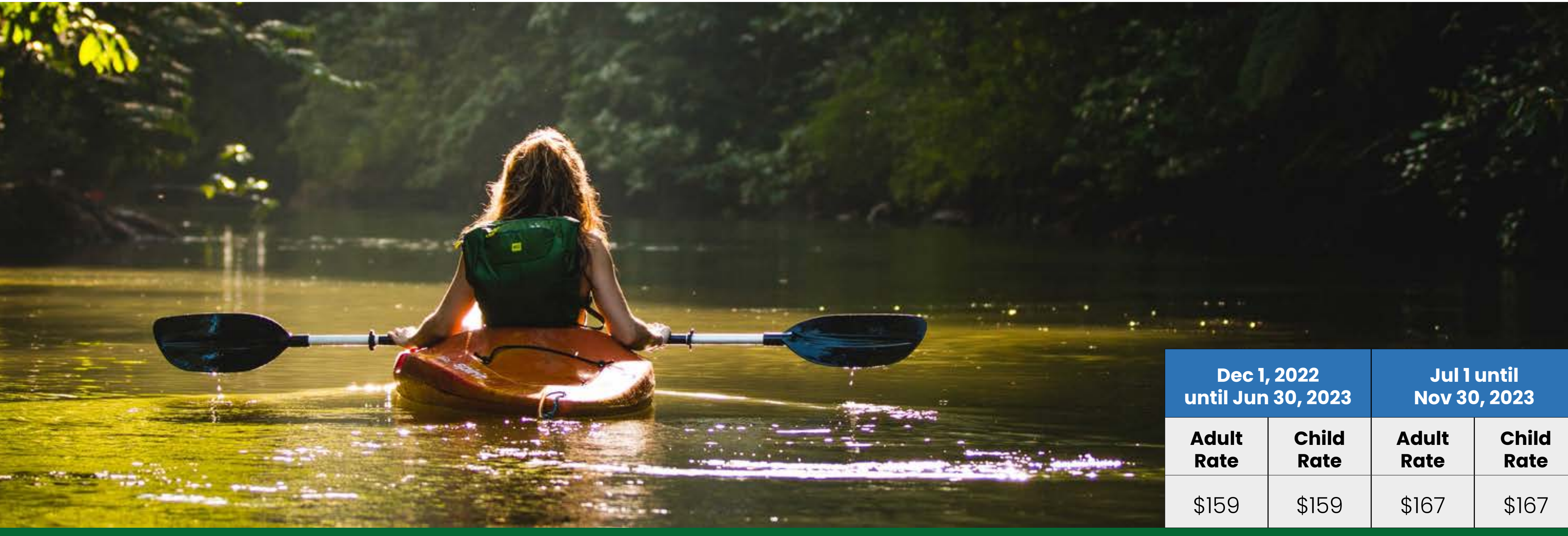
Half Day Tour | Minimum 2 pax | Difficulty Level: Medium

Includes: Transportation, bilingual guide, fruits, snacks and bottled water.