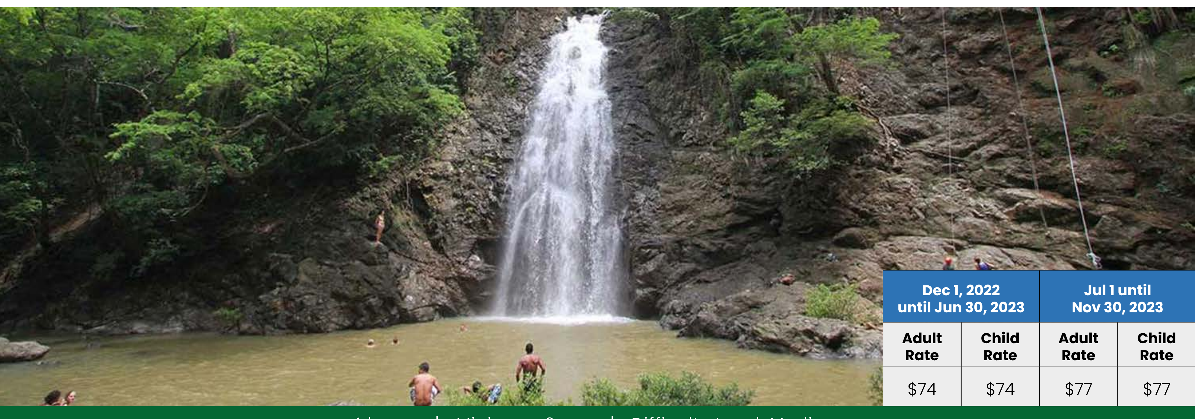
4 hours | Minimum 2 pax | Difficulty Level: Medium

Includes : Transportation, bilingual guide, water and guide. What to bring : Swimsuit, extra clothes, closed shoes, sunscreen, insect repellent. Children Rate Policies : Rates for children apply from 5 to 12 years old. Notes : Transportation may is not included from outside Santa Teresa area but available for an extra fee.