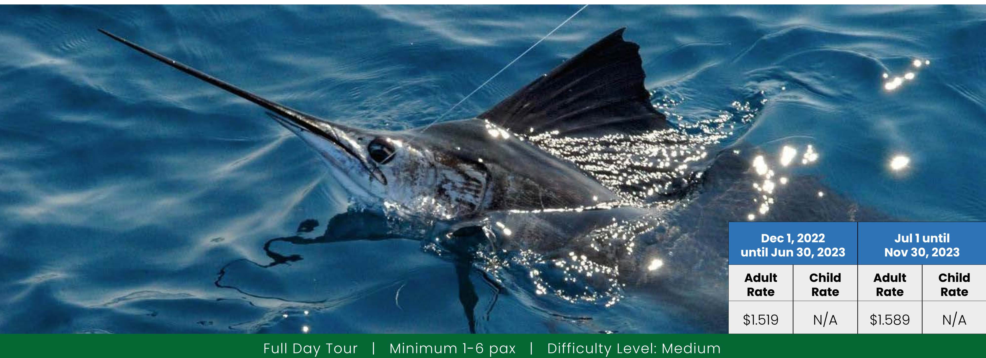
Full Day Tour Minimum 1-6 pax

Includes: Captain and Mate, all fishing gear and bait, lunch, soft drinks, beer, snacks and fruits. What to bring: Comfortable clothes, sandals or tennis shoes, sunscreen, swimsuit, towel, extra clothes, hat, camera. Notes: Transportation may is not included from outside Santa Teresa area but available for an extra fee.