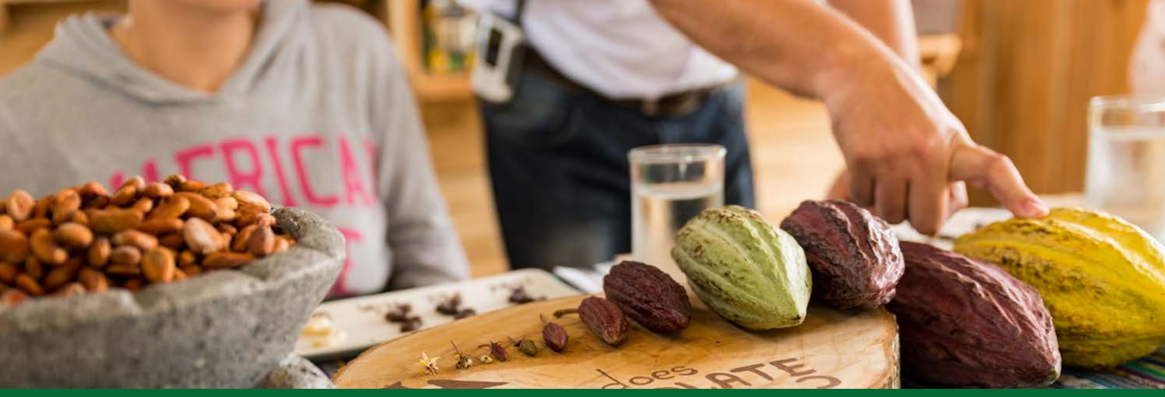
Half Day Tour | Minimum 2 pax | Difficulty Level: Easy